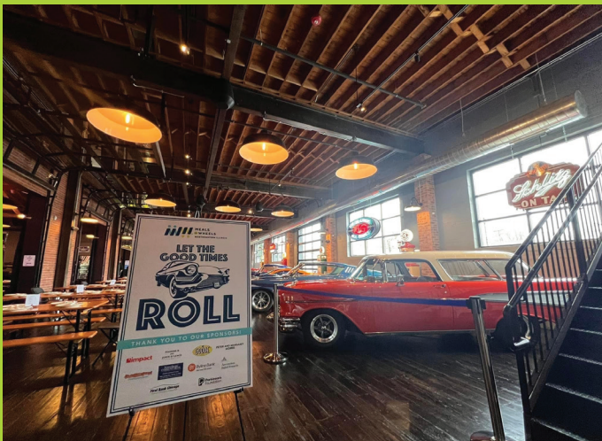
Double Clutch Brewing Company Car Showroom

Your organization likely has strategic goals that go far beyond profit margins. They might involve brand presence and loyalty, satisfied employees and community impact. By partnering with Meals on Wheels Northeastern Illinois, your organization can reach these goals while ensuring that seniors are supported and not forgotten.